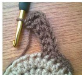
11. Hdc in base of each of the 5 Fhdc just made