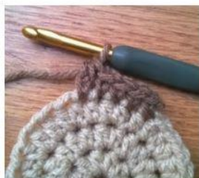
5. Yarn over and draw through 3 loops on hook to complete the Beg-Fhdc.