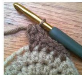
8. Yarn over and draw through 3 loops on hook to complete the Fhdc