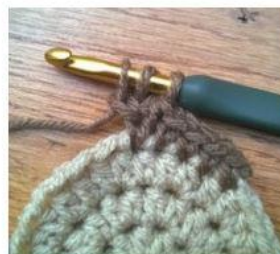
7. Yarn over and draw through one loop on hook (the "chain")