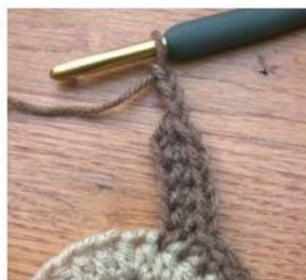
10. Ch 3