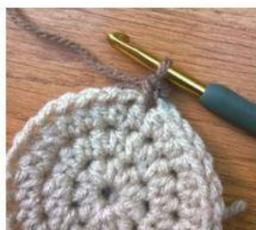
1. With right side facing, join 2 nd color with sc in any hdc

Rnd 4: With right side facing, join 2 nd color with sc in any hdc, sc in next 3 hdc, *Beg-Fhdc in next hdc, Fhdc 4 times, ch 3, hdc in base of each of the 5 Fhdc just made, hdc in next hdc, sc in next 4 hdc; repeat from * around to last 2 hdc, Beg-Fhdc in next hdc, Fhdc 4 times, ch 3, hdc in base of each of the 5 Fhdc just made, hdc in last hdc; join with slip st in first sc. (20 sc, 25 Fhdc, 25 hdc, and 5 ch-3 spaces)