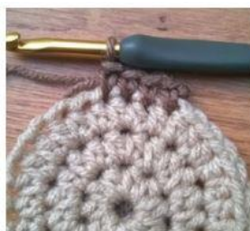
2. Sc in next 3 hdc, sc in any hdc