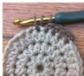
3. Start Beg-Fhdc = Yarn over insert hook in indicated stitch and pull up a loop