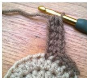
9. Work 3 more Fhdc (1 Beg-Fhc + 4 Fhdc = a total of 5 Fhdc)