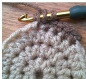
6. Start Fhdc = Yarn over, insert hook into the "chain" of the previous stitch and pull up a loop. (photo shows through yarn over before pulling up loop).