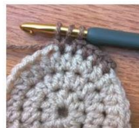
4. Yarn over and draw through one loop on hook. ("v" just below hook is "chain")