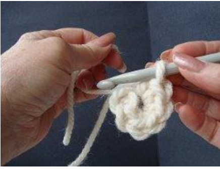
Photo below shows the magic circle finished, with the hole gathered closed.