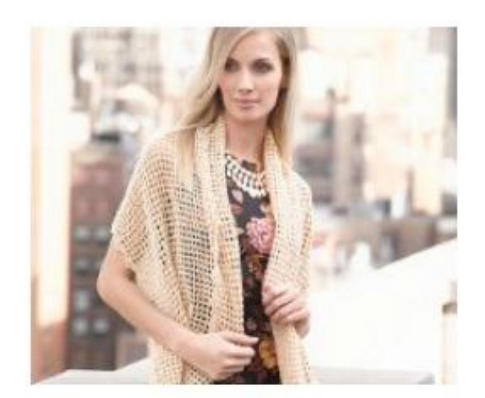
Sign up for All Free Crochet's Free Newsletter