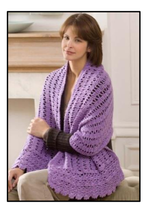
Special Thanks The Firefly Hook Red Heart Yarns Premier Yarns