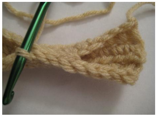
Handle made flat SI stitch the sides together to form a rod