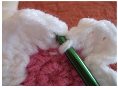
4. After completing 5 petals sl stitch to the base of the 1st petal