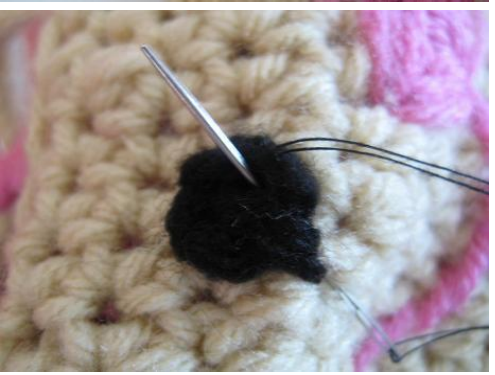
3. Pull the tails into the basket and knot it inside