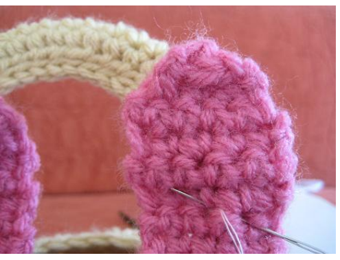
3. Completed handle with flat ends4. Sew the bunny ears onto the handle sewing down