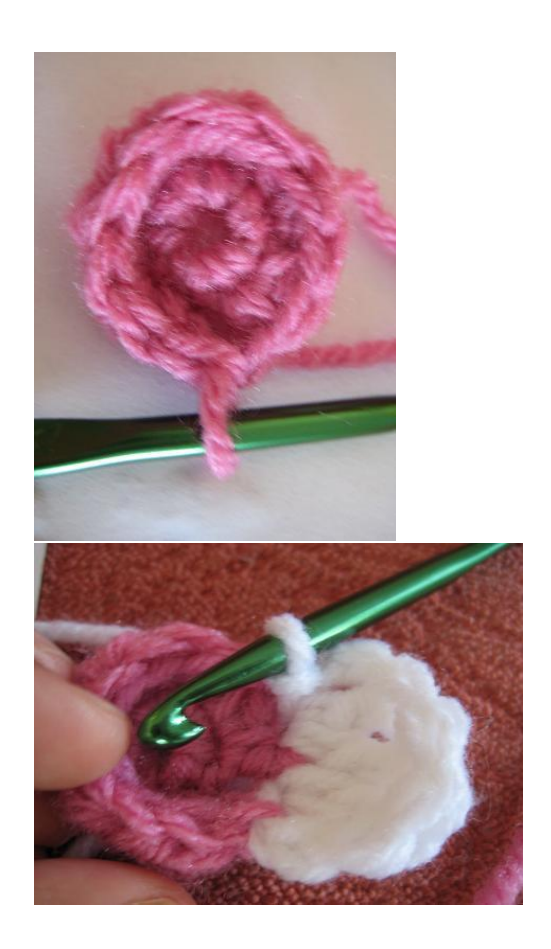
2. Flower Center3. One petal worked across 2 stitches